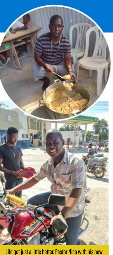
motorcycle gifted from a fellow Voodoo Ranger.

Join us in praising God... for calling, preserving, and equipping warriors for the sake of His Kingdom!