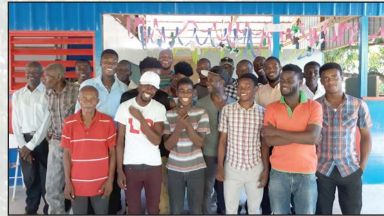
Intentionally discipling the men in the church is making real progress. We see much spiritual growth as a result. Here are some of the men who are being actively discipled.