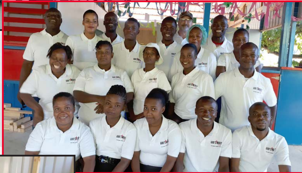
Our Church and School Staff: Pastor, Principal, Teachers, Helpers, Kitchen and Custodial Staff A great team with great chemistry.