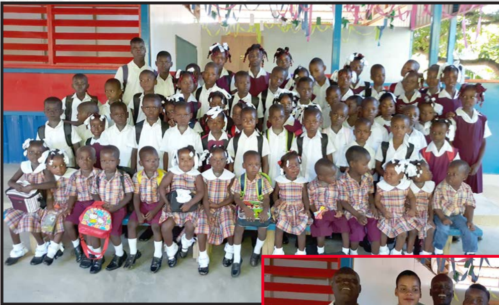
The School of the God of Perfection 2019/20 84 students (Pre-School, Kindergarten and Grades 1-5) God is a blessing to Kilbite