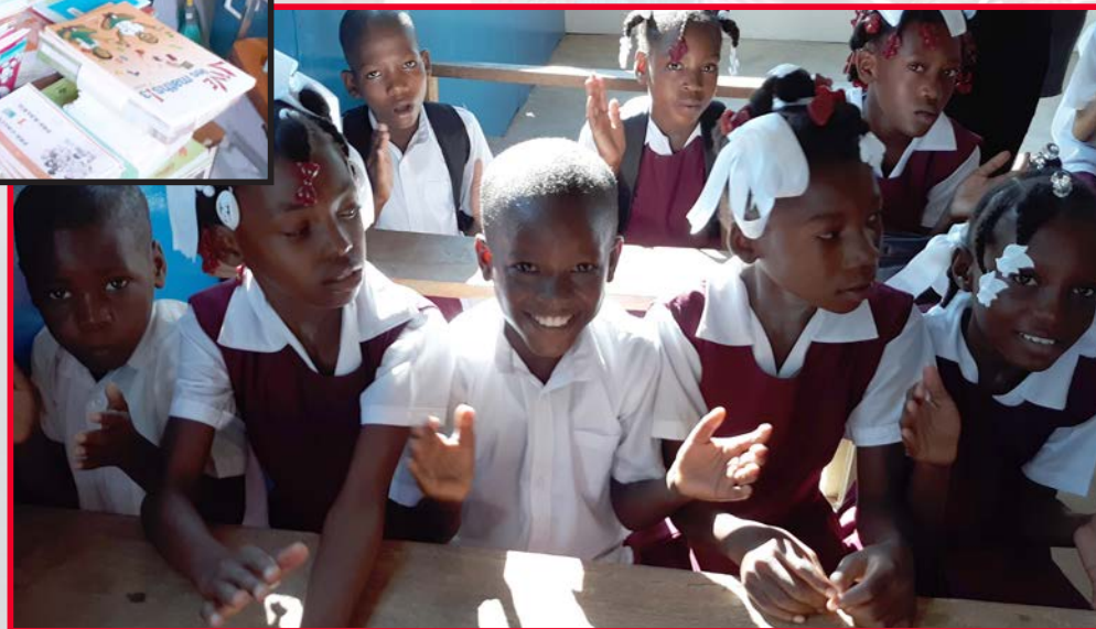
Here is a picture from chapel service on our first day of school. It is a joy to hear the children sing to Jesus.