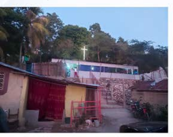
The Church of the God of Perfection at dusk in Kilbitè

Our churches are eager to learn and enjoy worship. We are a tight group led by godly men.