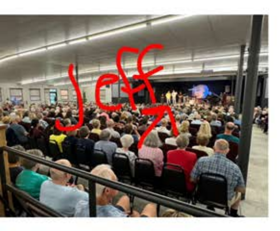
A full house at the Cedar Falls Bible Conference