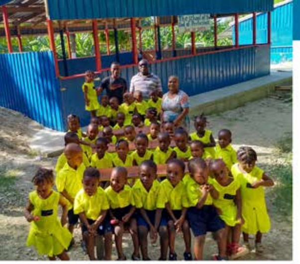
The 2024-25 Kindergarten Class and their New Building!