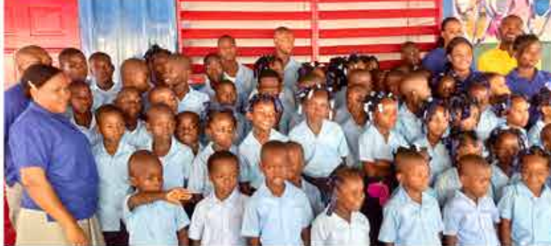
The School of the God of Perfection 1st-6th graders.

Nine years ago The School of the God of Perfection was birthed in our little jungle village. We started with 18 kindergartners a teacher and a helper. God has grown us to a place where the foundations of faith and life are built.