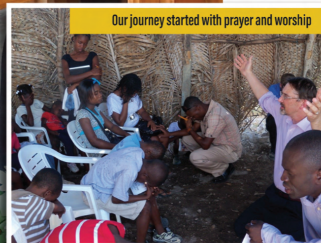
Our journey started with prayer and worship