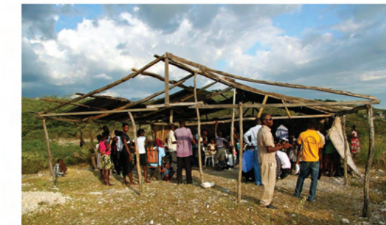
January 27, 2013, our first worship service

Rejoice with us! We give thanks and honor God! He gives Kilbitè victory through our Lord Jesus Christ!